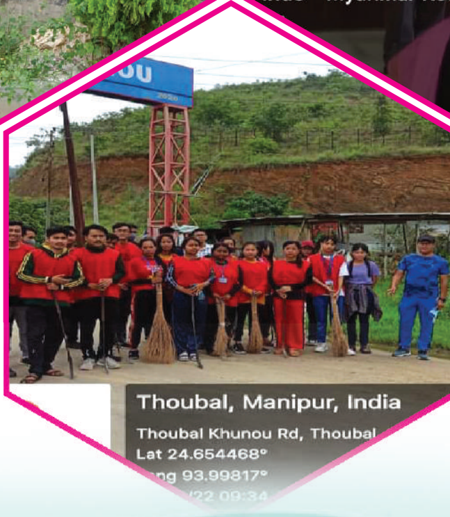
Thoubal, Manipur, India