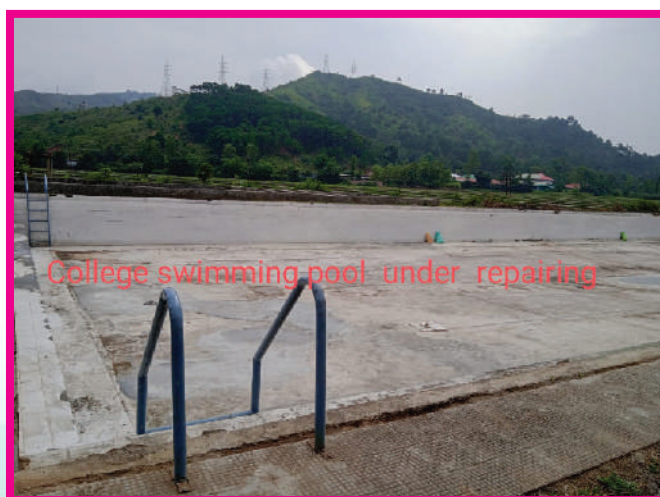
College swimming pool under repairing